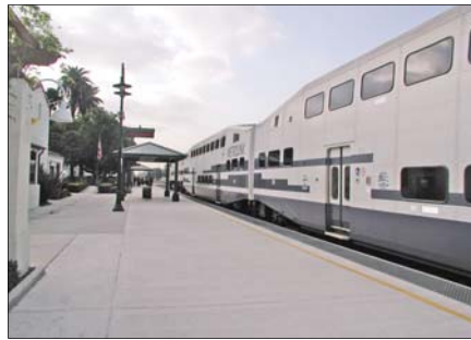
Orange Metrolink Station

Metrolink station and Orange County Transportation Authority (OCTA) bus transit center. In its 11th year with Metrolink service, it is a heavily utilized station, providing commuters on the Orange County Line with service to downtown Los Angeles, and acting as a transfer station for Inland Empire commuters who work in Anaheim. The Santa Fe Depot is also a destination station, bringing visitors into the City for antiquing, specialty shopping, dining and other special events in Old Towne