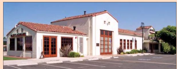
Santa Fe Depot as renovated in the 1990s