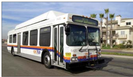
Orange County Transportation Authority (OCTA) Bus

Today, the Santa Fe Depot is still the heart of the City’s public transportation system, functioning as a modern-day