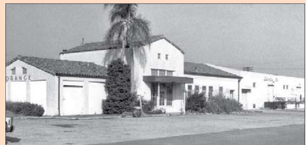
Santa Fe Depot as constructed in 1938